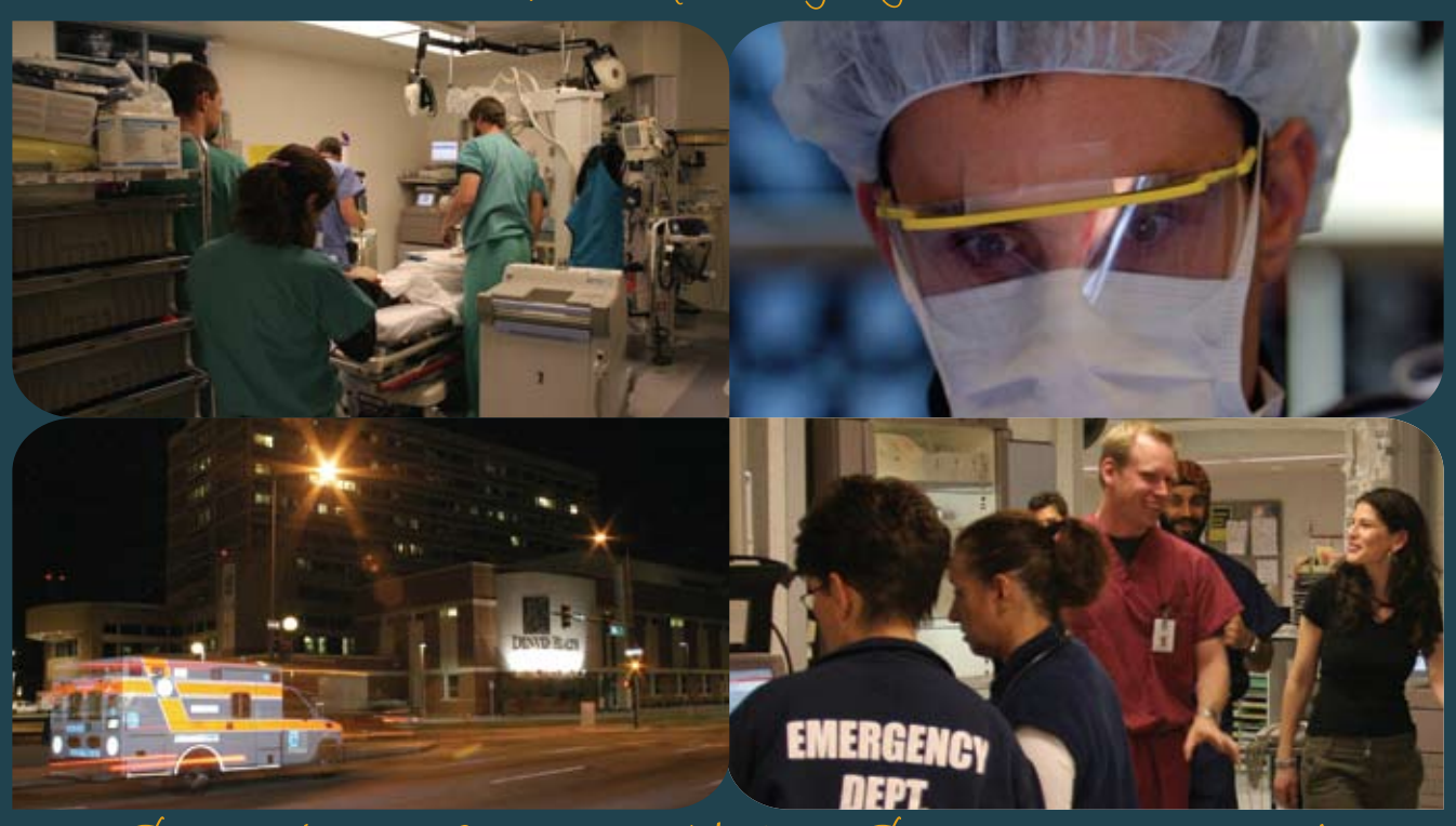
Denver Health Emergency Medicine Department — 2009